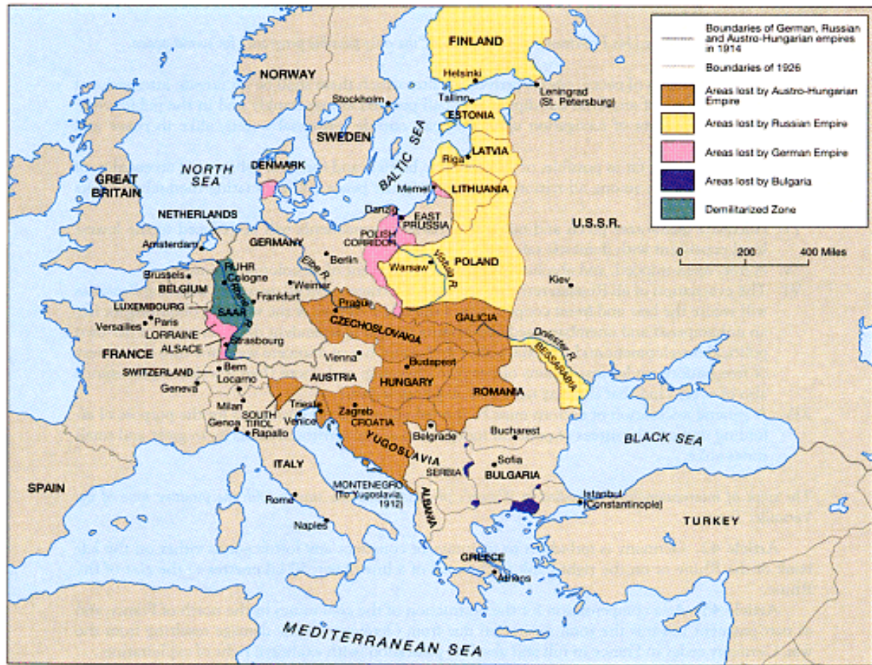
MAP 27.4 TERRITORIAL SETTLEMENTS IN EUROPE, 1919-1926