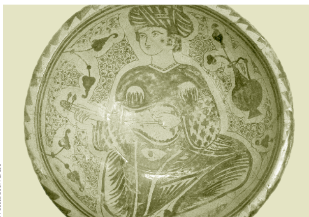
Large ceramic dish from the Hegira 5th century/11th century C.E., a part of the collection of the Museum of Islamic Art in Cairo. Lute players were a common type of musician at the Fatimid court and were popular motifs in ceramic design. Both ceramics and imported lutes were prized trade goods in Renaissance Europe.