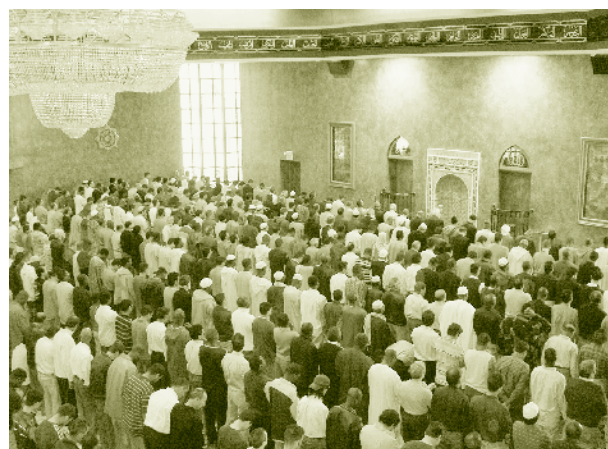
Worshippers at the Islamic Center of Greater Cincinnati.

"Muslim" is the correct term for a person who believes in Islam as a religion. It is another Arabic form of the same root as "Islam." Its grammatical form is like a participle which means "one who has achieved peace through submission to God." In reality, however, no person can say they have fully achieved this state of being in this life, except the prophets. One can call oneself a Muslim, but to be Muslim means to live as a person striving to achieve a state of peace with God. For this reason, being Muslim is not a fixed identity but a process. Every Muslim hopes that their striving, their attempt, is accepted by God at their life's end but knows that this judgment rests with God alone. By the same token, anyone who speaks the shahada (or Islamic creed) must be accepted by others as a Muslim, and there is no excommunication of anyone who has professed the faith. It is fair and proper, however, to critique another Muslim's behavior as falling short of Islamic standards, but one may not impugn another's faith itself.