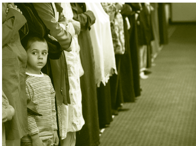
Women praying in the women's section of the mosque at the Islamic Society of Akron and Kent. Younger children usually attend prayers with their mothers.

A mosque is an Islamic house of prayer. The word mosque is actually a corruption of the original Arabic word masjid by way of the Spanish word mesquita . The name refers to the act of sajda , or sujud , which is the