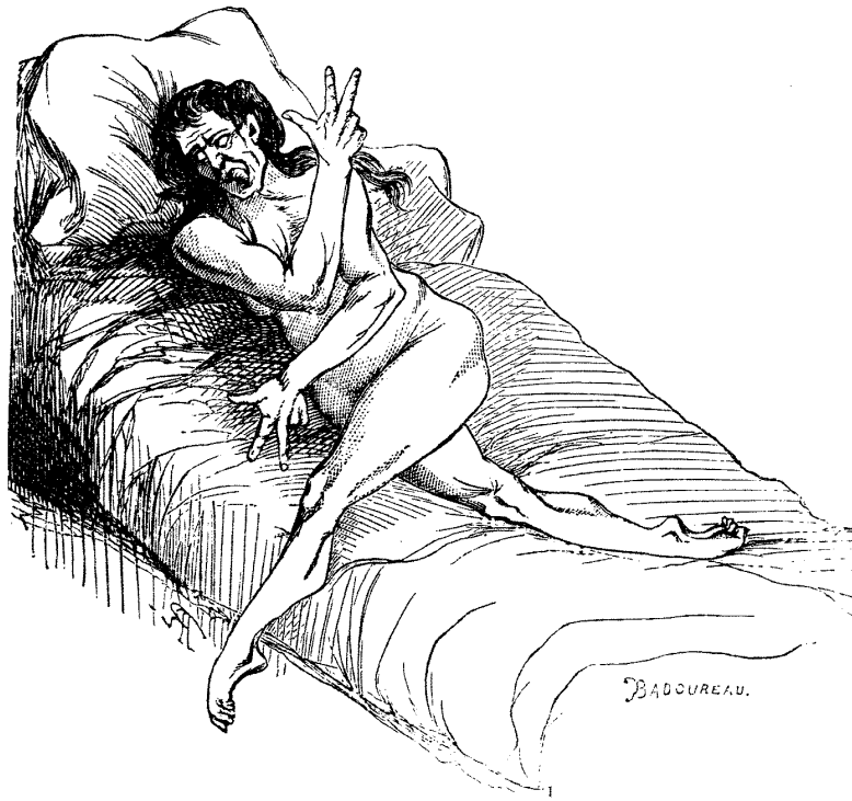
A hysterical convulsive attack of one of the patients in Salpêtrière Hospital during the nineteenth century. J. M. Charcot, the physician in charge of the clinic, spent much of his time studying the disorder. Note the crossed legs, similar to some of the Salem girls' fits.